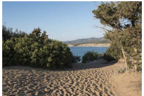
Lara Bay Akamas

A few minutes into your drive in the park you will come across a sign for Avakas gorge, a trekker's paradise offering spectacular views and a plethora of local flora and fauna, including the endangered Centaurea akamantis , an endemic plant with purple flowers found only in the gorge. The nature trail through the gorge, carved out of limestone rocks as high as 30 metres and quite narrow at points, is approximately 1.2 kilometres