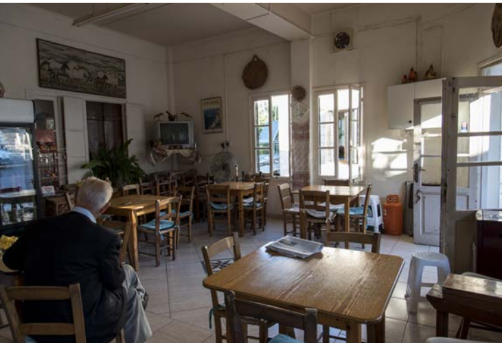
Tsada local coffee shop

With far-reaching mountain and valley views and unspoilt countryside, Miliou offers the perfect setting for long walks in the countryside and is ideal for birdwatching