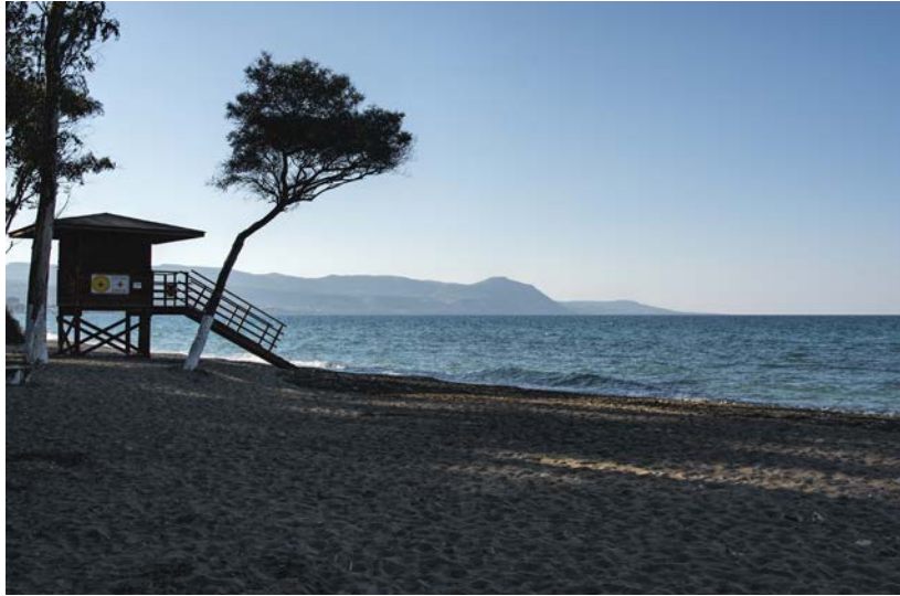
Polis Camping Area

some fresh fish meze or take a left to reach one of the island's most popular tourist attractions, the Baths of Aphrodite.