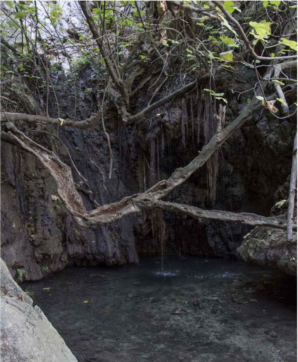
The Baths of Aphrodite

Drive through Mesogi and on to Pafos where you can call it a day and look back at all the spectacular places you explored.