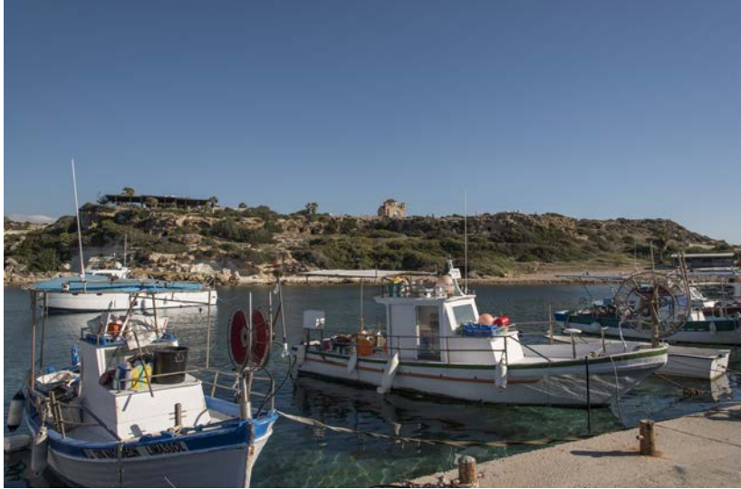
Pegeia Fishing Harbour

long and requires appropriate footwear. The gorge is extremely rich in flora, which includes ferns, Phoenician junipers and wild oak and fig trees, and serves as a natural habitat for many reptiles, butterflies, hawks and owls, wild goats, rabbits and foxes. Exercise due care as the terrain is slippery and make sure to look out for falling rocks.